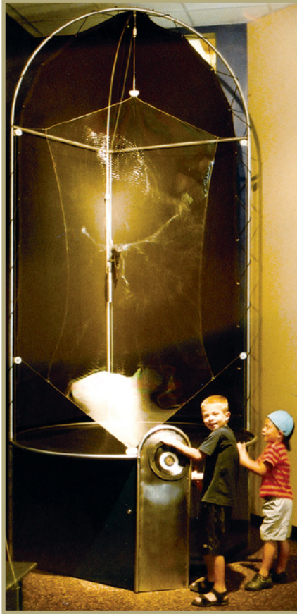
Exhibit w/o backdrop